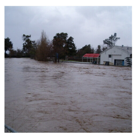
December 2017 high water at top of levee in East Palo Alto.

The project will restore more than 600 acres of former salt ponds, create new and improved habitat and enhance public recreation by creating new trails. With approximately 100 acres of prime development potential, the proposed protections will enable much-needed development in a community that has historically been under-developed and underserved by public programs.