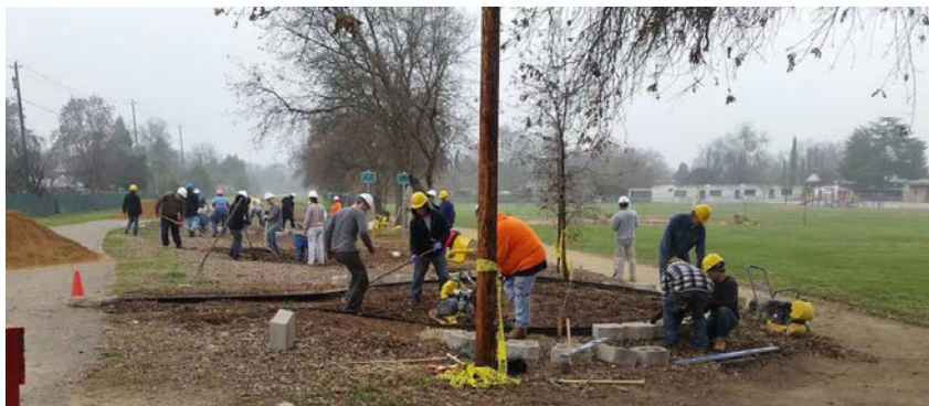
Workers from Northern California Construction Training rebuild the trail and add amenities.

discouraged when they hear it could take six months, a year or more to get a project off the ground."