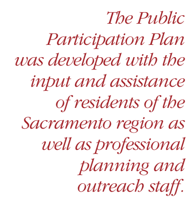
Public Input on the Public Participation Plan

This PPP was developed with the input and assistance of residents of the Sacramento region as well as professional planning and outreach staff. Several community-based organizations and community leaders representing a broad spectrum of the traditionally underserved and underrepresented in the Sacramento region also participated. The plan also received input from affected public agencies, representatives of public transportation employees, freight shippers, providers of freight transportation services, private providers of transportation, representatives of users of public transportation, representatives of users of pedestrian walkways and bicycle transportation facilities, representatives of the disabled, and other interested parties.