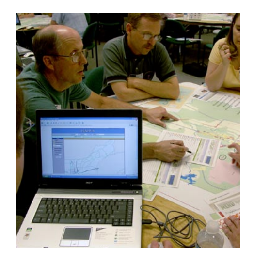
The public should also have reasonable access to technical assumptions and specifications used in planning and emissions models.

The public should also have reasonable access to technical assumptions and specifications used in planning and emissions models. This includes access to input assumptions such as population projections, land use projections, fares, tolls, levels of service, the structure and specifications of travel demand, and other evaluation tools. SACOG's Regional Data Center provides public access to SACOG publications, maps and digital data. Current and projected population, housing and employment data are available in a number of different digital and printed formats. Much of this data is available free of charge on SACOG's website. Jurisdictional level "Data Summaries" are provided free of charge and larger printed reports are available at reasonable cost or may be used at the SACOG offices at no charge. Major reports are also available at local libraries. Requests for raw data, special aggregations, non-standard formatting and custom geographic information system (GIS)-based maps are charged on a "time and