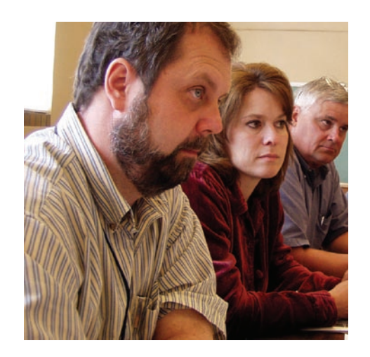
SACOG will incorporate traditional and grassroots methods for public outreach in an effort to ensure public input and involvement is comprehensive and reflective of the region's demographics.

SACOG interagency consultation procedure, as required by 40 CFR $93.105, will be utilized to ensure appropriate consultation with federal, state, and local agencies, resolution of conflicts, and public consultation takes place. SACOG will provide reasonable opportunity for consultation with state air agencies, local air quality and transportation agencies, the United States Department of Transportation (USDOT), and the EPA. In making its conformity determinations on transportation plans, programs, and projects, SACOG will establish a proactive public involvement process which provides opportunity for public review and comment by, at a minimum, providing reasonable public access to technical and policy information considered by the agency at the beginning of the public comment period and prior to taking formal action on a conformity determination for the MTP and MTIP, consistent with these requirements and those of 23 Code of Federal Regulations (CFR) §450.316(a). Any charges imposed for public inspection and copying will be consistent with state and federal guidelines for public records requests.