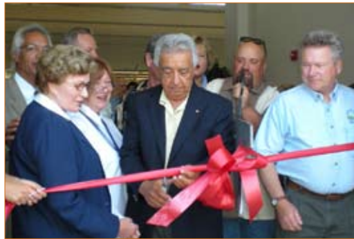
Officials cut the ribbon for the new La Mesa Library on July 18.