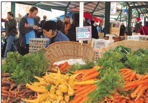
City of Davis farmers market

Sustainable communities foster and maintain a high quality of life for their residents on an ongoing basis. By taking advantage of opportunities to invest in energy efficiency, renewable energy, well-designed communities, water supply, waste-water management, efficient transportation and other sustainability practices, local leaders can improve the fiscal health of local agencies and the economic prosperity of residents and businesses.