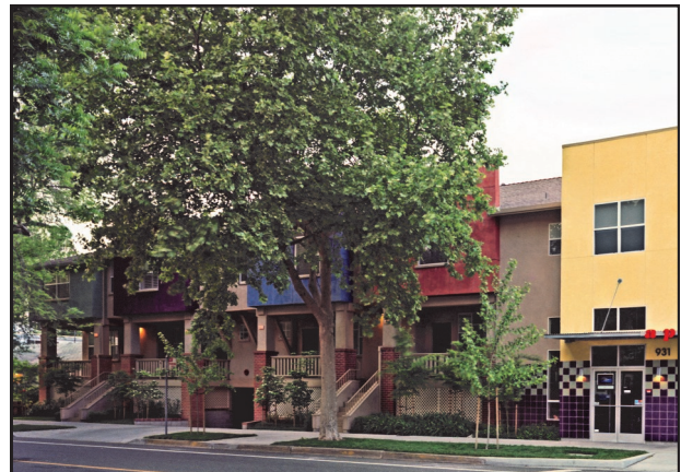
10th and T Street, Sacramento