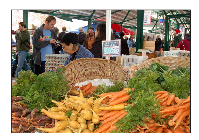
City of Davis farmers market

Sustainable communities foster and maintain a high quality of life for their residents on an ongoing basis. By taking advantage of opportunities to invest in energy efficiency, renewable energy, well-designed communities, water supply, waste-water management, efficient transportation and other sustainability practices, local leaders can improve the fiscal health of local agencies and the economic prosperity of residents and businesses.