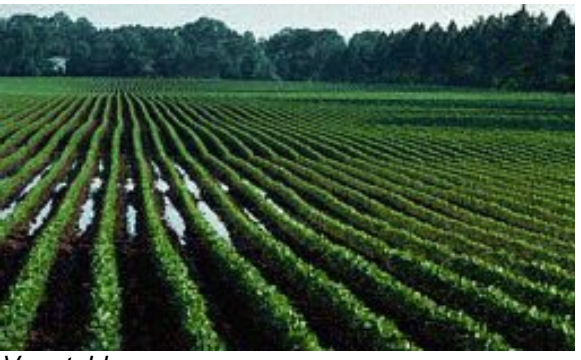
Vegetable row crops