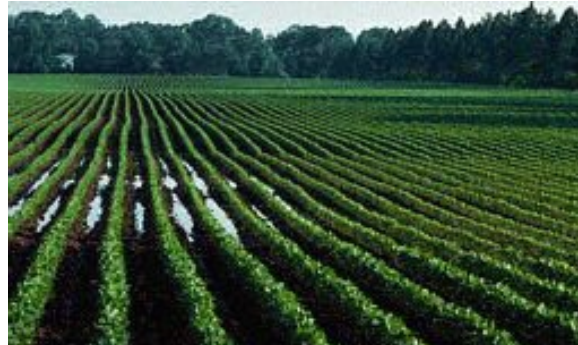
Vegetable row crops