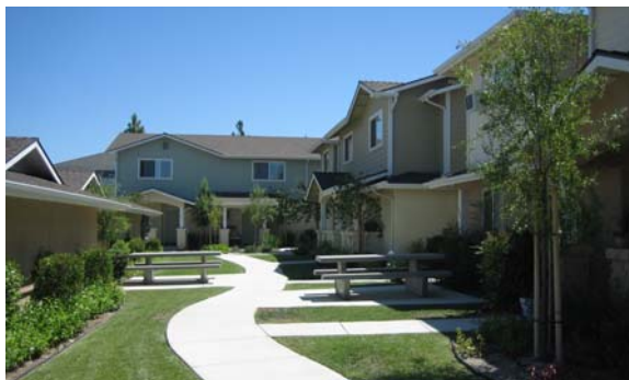
Avenida de Amigos – workforce housing