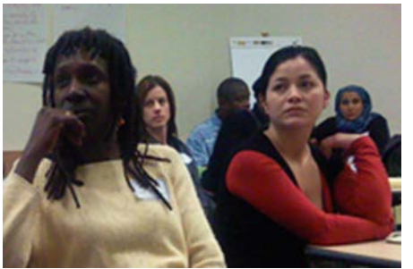
Flintridge Center in Pasadena

"Improving the Quality of Life in Northwest Pasadena and Altadena"