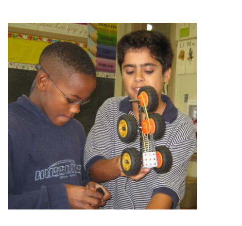
Summer Robotic Class

Commitment by School/City Leadership to Improve Partnership