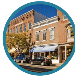
RURAL COMMUNITIES / SMALL TOWNS