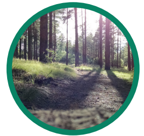
WORKING LANDSCAPES/ NATURAL RESOURCE LAND