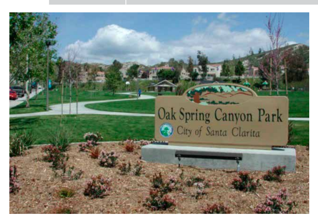
Oak Spring Canyon Park, Santa Clarita