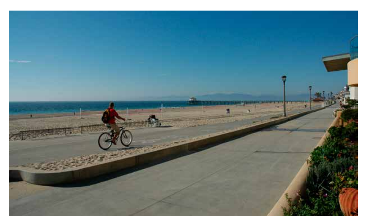
Bike rider on path in Manhattan Beach