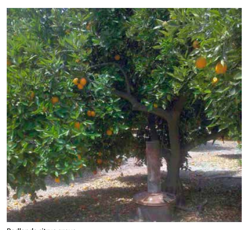
Redlands citrus grove.

For more information about Redland's accomplishments, visit: www.ca-ilg.org/BeaconAward/Redlands.