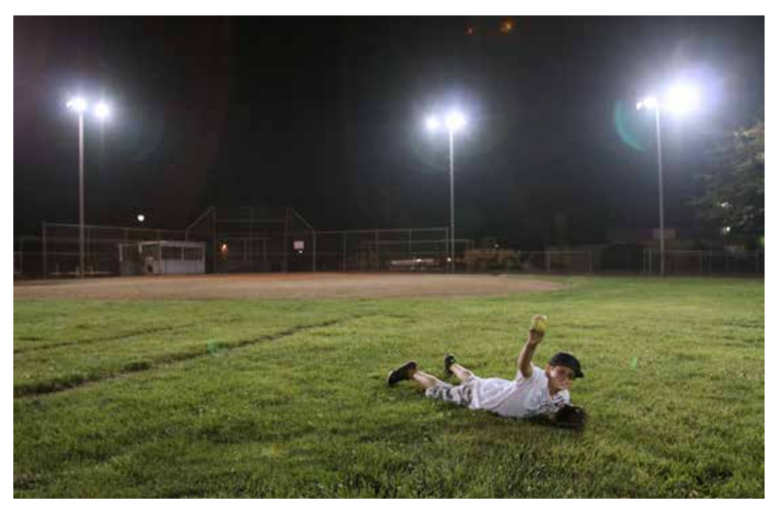
Valdivia Ball Field at Rangel Park, Beaumont.

For more information about Beaumont's accomplishments, visit www.ca-ilg.org/BeaconAward/Beaumont.