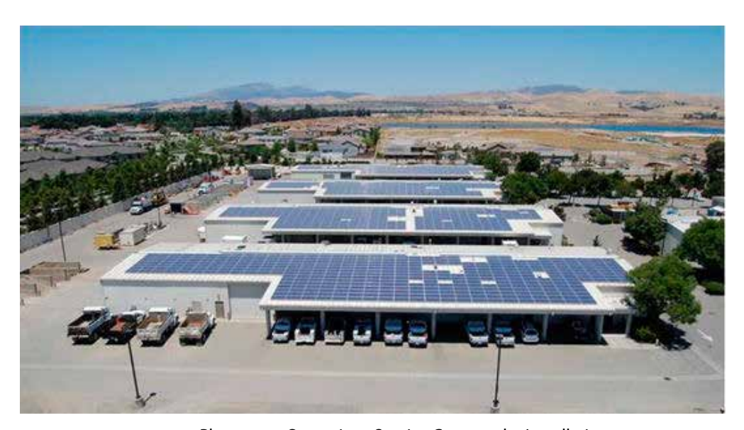
Pleasanton Operations Service Center solar Installation