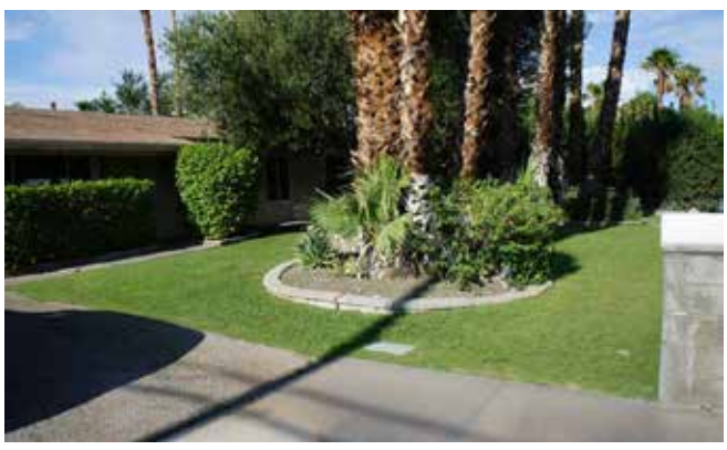
A residence with turf and a residence landscaping after turf removal.

For more information about Palm Spring's accomplishments, visit www.ca-ilg.org/BeaconAward/PalmSprings.