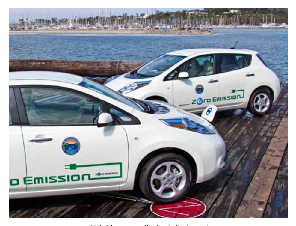
Hybrid cars near the Santa Barbara pier