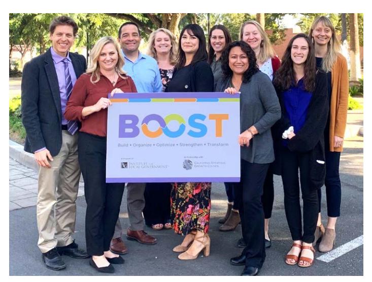
Staff from ILG, the California Strategic Growth Council and City of Paramount at the kick off meeting in October 2019

Strategies for resilience and adaptation must be front and center in the climate planning efforts of communities where many are hurt first and worst by the impacts of climate change. While some strategies could yield more significant greenhouse gas emissions reductions, Paramount found it was important to include measures that were also directly meaningful to the community's everyday lives. Measures such as free transit vouchers would reduce vehicle miles traveled and greenhouse gas emissions from personal vehicles, but it was even more important to the community to focus on promoting ridership of public transit and ensuring adequate access to key destinations. Including resilience in the CAP was not just about critical infrastructure and funding plans, but also about incorporating ways to conduct specific outreach and education, or offer incentives for the most vulnerable residents.