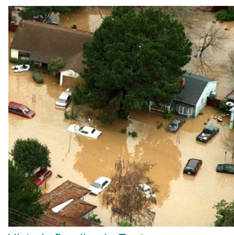
Historic flooding in East Palo Alto illustrating the need tor comprehensive flood protection

In the City of East Palo Alto, a comprehensive partnership is helping to address flood protection needs. The city, along with the San Mateo County Office of Sustainability, the San Mateo County Flood and Sea Level Rise Resiliency District, the San Francisquito Creek Joint Powers Authority, ILG, Acterra and Nuestra Casa worked together to prepare an application for an Urban Flood Protection grant. The call for proposals could not have been a more timely opportunity for the SAFER Bay Project, a multiphase project that required several funding sources to remove flood burdens and protect the community of East Palo Alto from impending sea level rise. The SAFER Bay Project is part of the ongoing efforts to fund critical flood protection and ecosystem support while at the same time addressing equity and environmental justice issues.