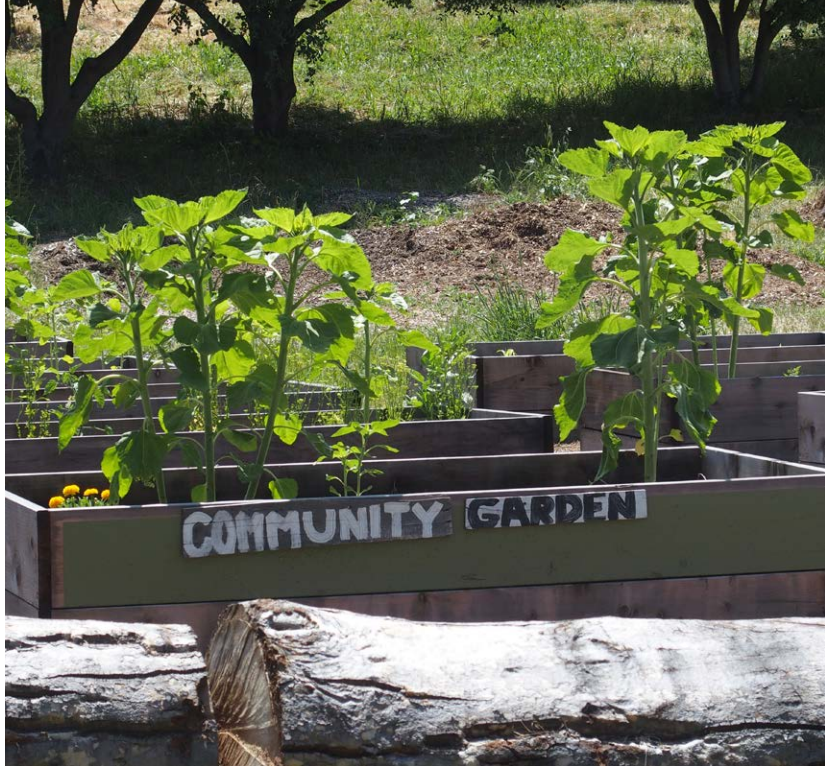
Navidad Community Garden in the City of Salinas

applicants, Salinas was one of 21 communities selected to move forward to Phase II. The application highlights the city's commitment to deep and authentic engagement with its residents, despite language and access barriers that can typically pose as roadblocks. It also emphasizes Salinas' holistic approach to fostering a healthy community for all residents by developing individual neighborhood specific plans with projects and policies targeted to the unique needs of those communities.