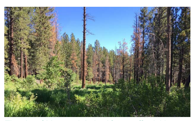
The site of Mammoth Lakes' future affordable housing development, The Parcel