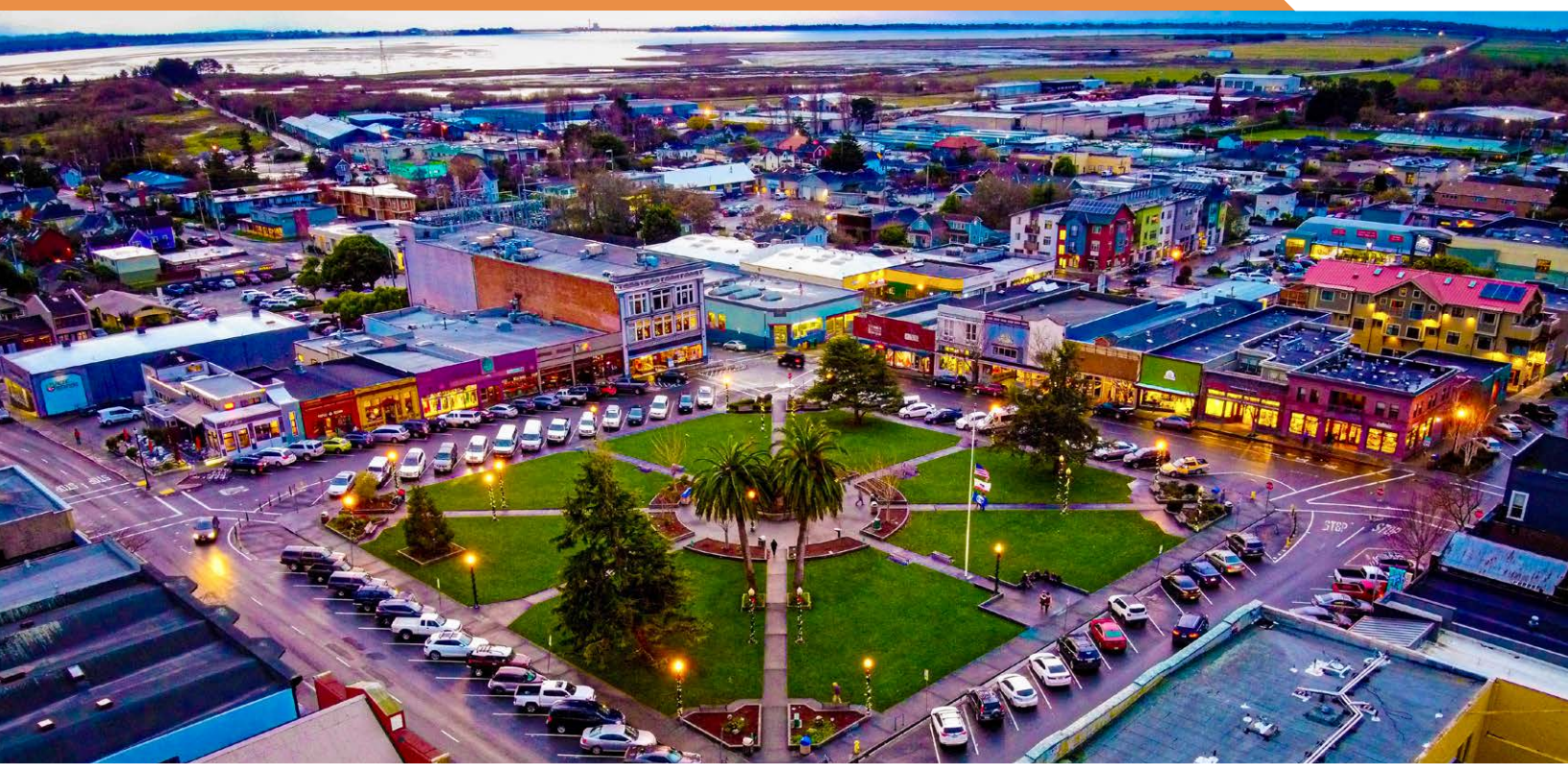
Aerial view of Arcata Plaza in 2020.

Authentic community engagement is key to building trust . A demonstrated commitment to inclusive and authentic community engagement is the cornerstone for all of the planning efforts in the City of Salinas. This has resulted in successful grant applications, like the Sustainable Agricultural Lands Conservation (SALC) Planning Grant, and award accommodations, such as the Robert Wood Johnson Culture of Health Prize. An inclusive and equitable approach with community input was critical for the City of Bakersfield to develop a community-driven proposal for the Sustainable Transportation Equity Project (STEP) grant, which will fund a process for more equitable transportation planning in the Southeast Bakersfield.