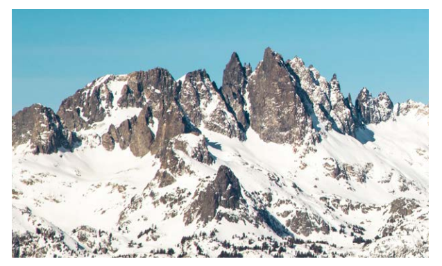
Mammoth Mountain covered in fresh snow

When it comes to technical assistance there is no one-size-fits-all approach. Underresourced and rural communities face a variety of obstacles that make it harder to obtain funding for projects that align with their unique circumstances. While climate and equity projects are sorely needed in these communities, they often struggle to compete in state