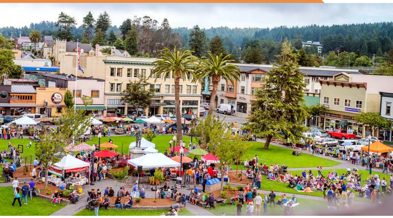
Aerial view of Arcata Plaza.

"This project represents the first time that Yurok citizens will have access to affordable housing in an area where there is a university, a Native American health clinic, transportation and all of the other quality-of-life improving amenities Arcata has to offer. We are extremely excited about this partnership with the City of Arcata. We are equally proud to be the first tribe to receive an Affordable Housing and Sustainable Communities grant, which is going to create numerous positive opportunities for tribal and non-tribal citizens."