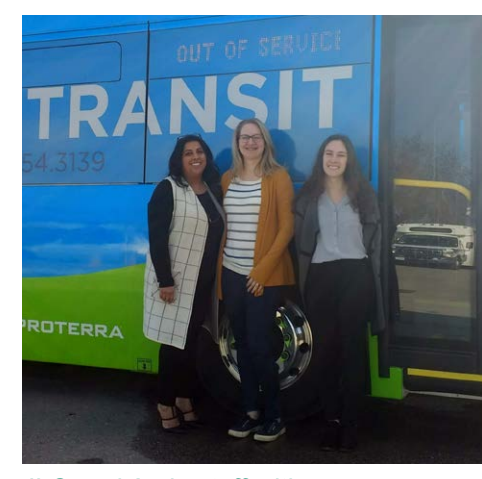
ILG and Arvin staff with one of Arvin's zero emission buses

Too often state organizations and others offer one-time assistance or opportunities to local governments. However, because of dynamic conditions and shifting priorities, ongoing and recurring assistance is vital for grant programs to help communities