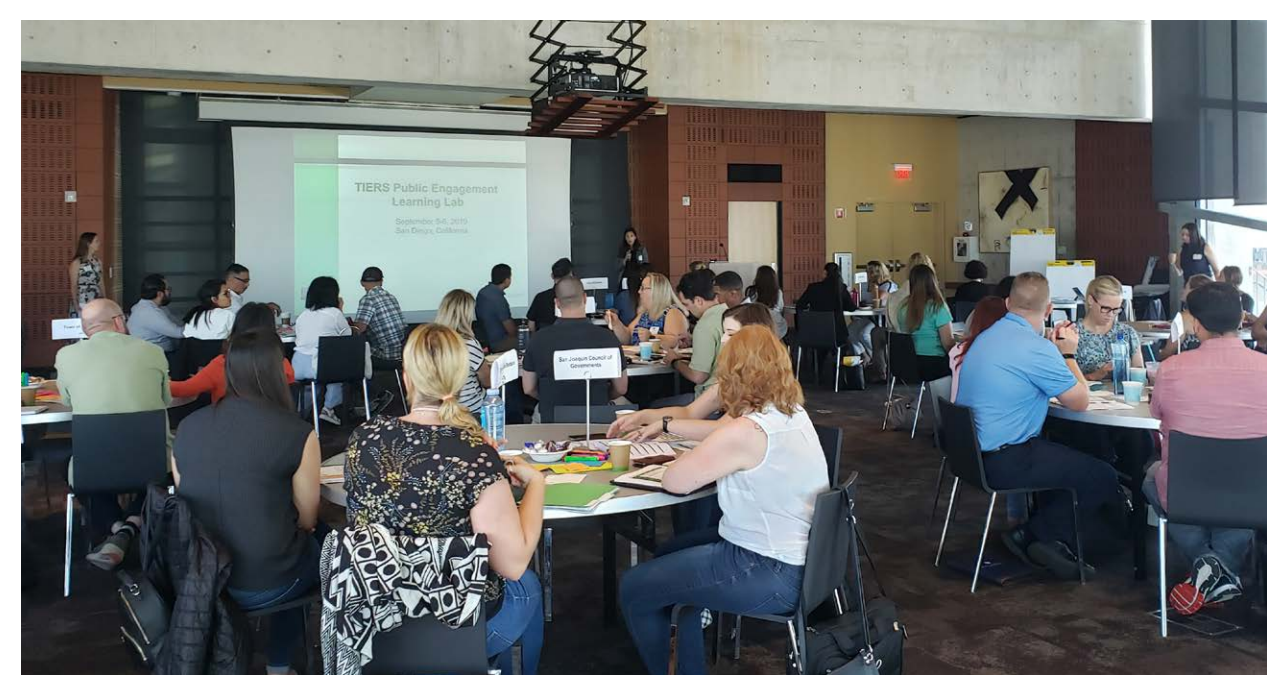
Local government staff participate in ILG's TIERS public engagement training in San Diego 2019

ILG also has a pillar of work focused on leadership and governance that helps local government leaders build a strong foundation of good government – trust, accountability, responsiveness and transparency. ILG's expertise in this area enabled the ILG team to provide strategic planning assistance to El Centro and a number of other resources and training opportunities for other BOOST communities. When the COVID crisis emerged, ILG provided a wide range of information on government operations, human resources, effective communications, budgeting and finance, labor negotiations and running an election in a pandemic. In all, the ILG team hosted over 15 webinars in 2020. All of which were offered free of charge to the BOOST communities and were recorded and distributed to those who were unable to attend in person.