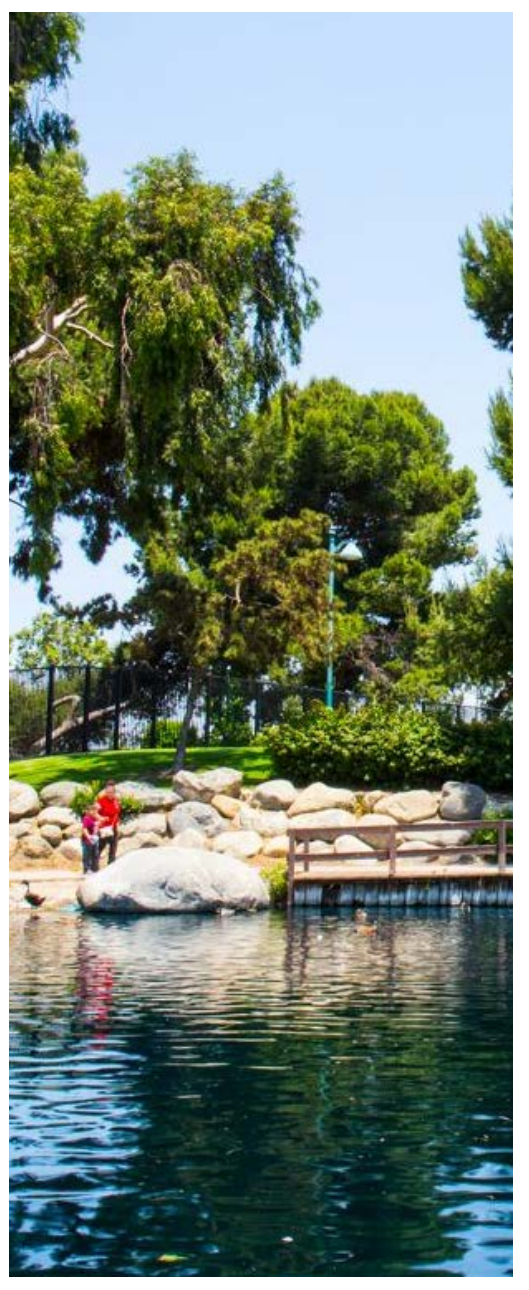
Spane Park, City of Paramount