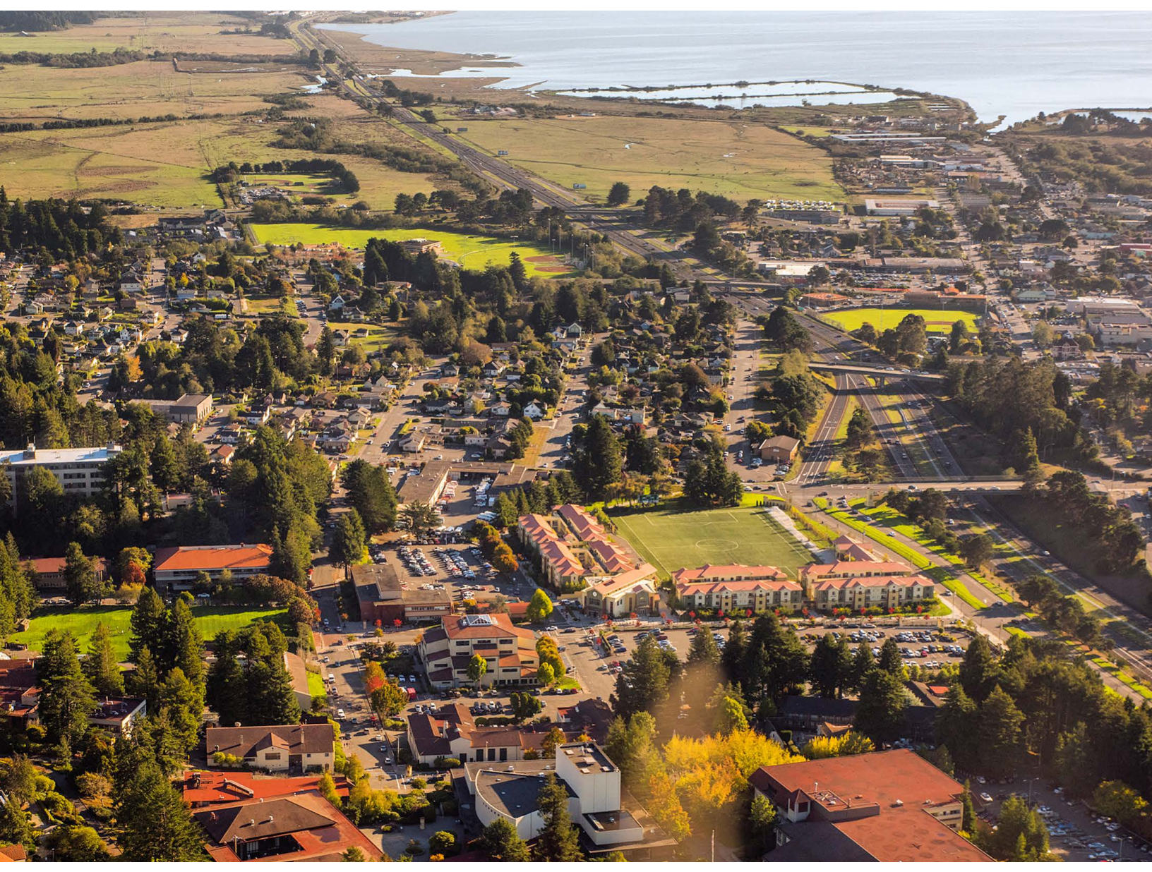
Aerial view of the City of Arcata.