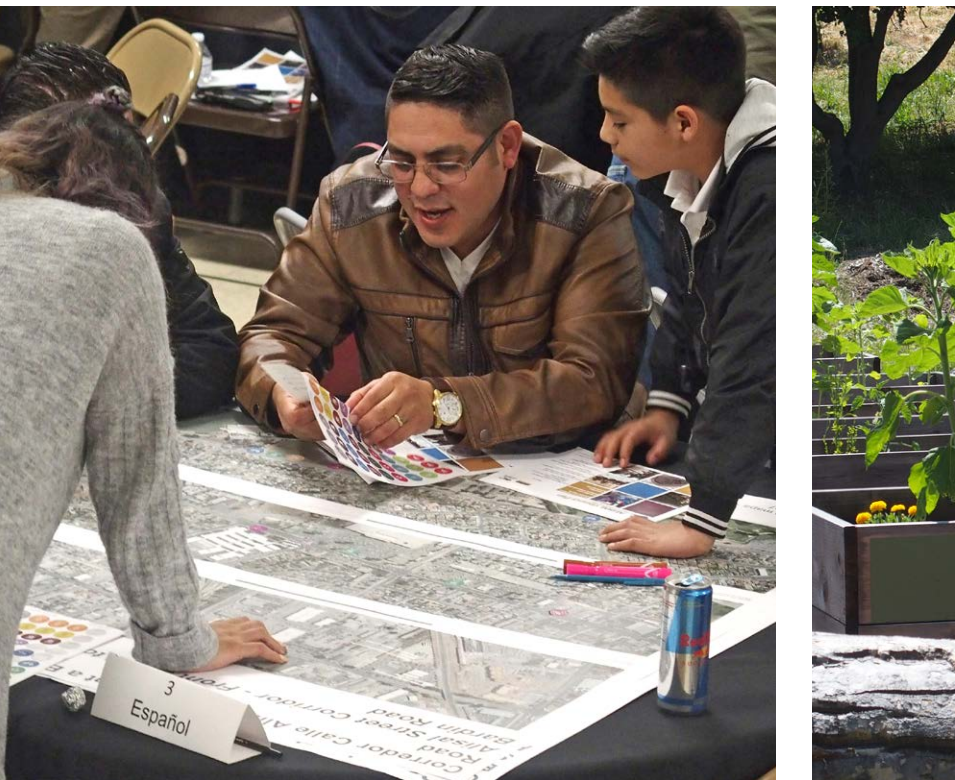
A father and son engage in a mapping exercise at the Alisal Community Design Workshop