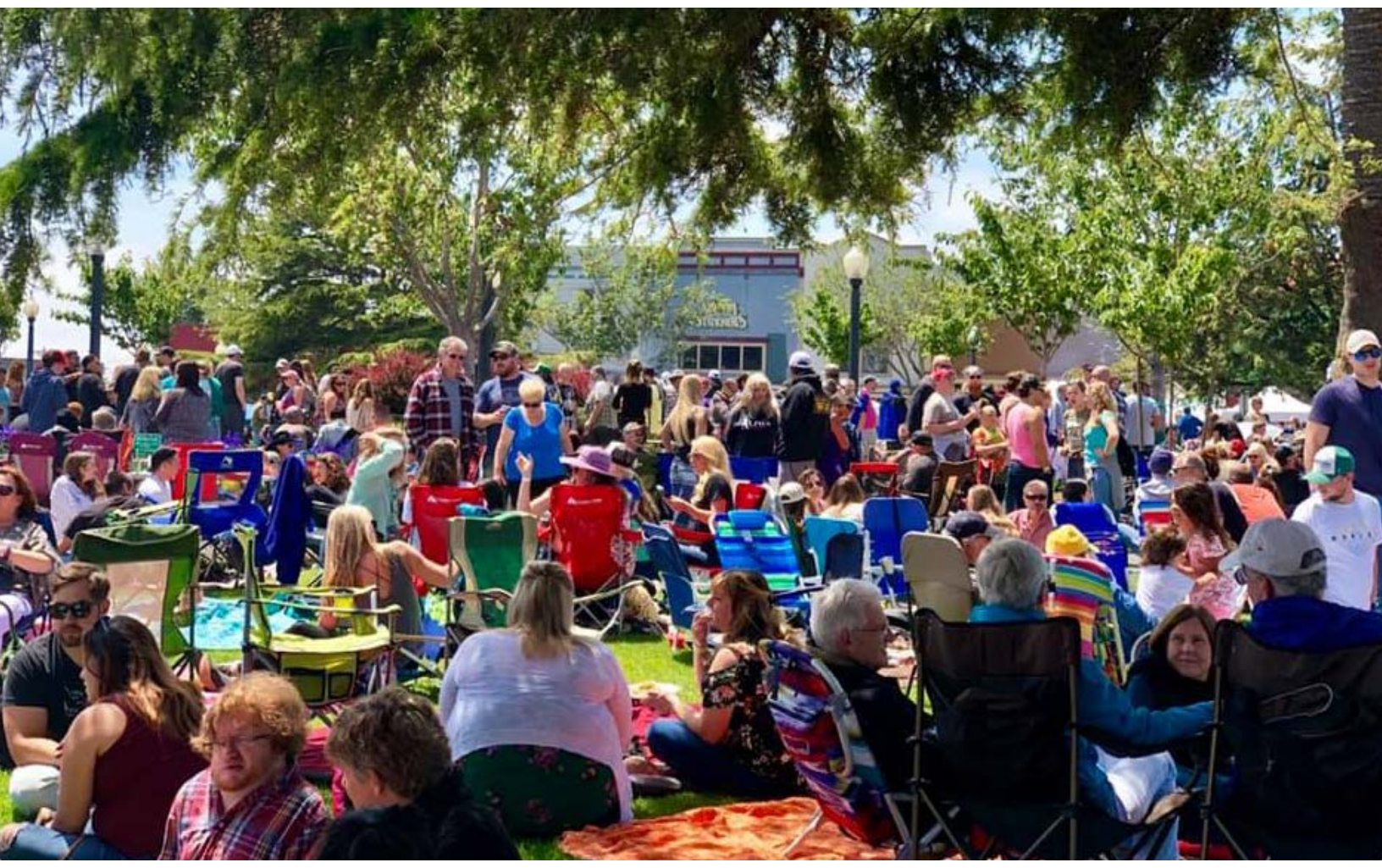
The City of Arcata's Oyster Fest in 2019

The BOOST Program allowed the ILG team to work intensively with ten cities and two regions across the state to build capacity, seek funding, address equity concerns and plan for a more promising future. Although each BOOST community and each local government in California is unique, they share the same goal of wanting to improve their communities and the lives of their residents. To that end, the ILG team hopes the best practices and lessons learned here can help other jurisdictions address the myriad of challenges they face and better serve their communities.