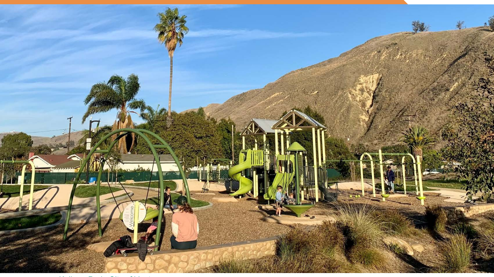
Kellogg Park, City of Ventura

Community leaders were the ultimate catalysts for the idea behind a grant application that aimed to connect a community of farmworker families to an existing biking and walking trail to help improve activity and access to key destinations such as schools, grocery stores, and parks. Community champions brought the project to city staff and ILG, thinking it might be a good fit for the STEP Program. After reviewing the STEP guidelines, ILG determined that the project was better suited for Cycle 5 Active Transportation Program (ATP) funding. Several non-profit organizations including The Sierra Club, Friends of the Santa Clara River, Bike Ventura and ILG wrote sections of the grant. City of Ventura staff and a consultant led the technical aspects and project coordination. Ongoing engagement ensured that the project included features that actually addressed community needs. The result of this unique collaboration was a winning application! The "Cabrillo Segment Multi-Use Path Gap Completion" project scored 90 points, the highest scoring ATP application ever for the City of Ventura. The grant application was the second highest scored for the county, which means that it is first in line for ATP funds.