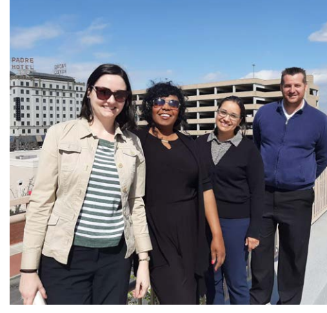
Staff from ILG, the City of Bakersfield and the MLKcommUNITY Initiative in February 2020

This effort will culminate in an action-based Transportation Equity Roadmap that the community and City of Bakersfield will implement together, even beyond the life of the grant. The Roadmap will chart a clear course for the development, funding and implementation of mobility improvements and communityidentified solutions that will significantly improve access to critical destinations and support workforce development.