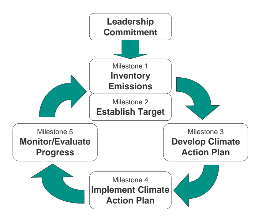
Figure 1.1 The Five-Milestone Process