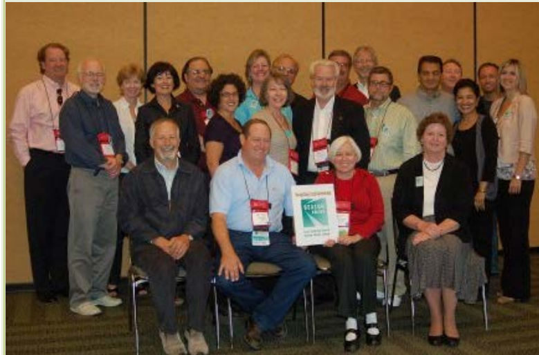
City Officials at the Beacon Award Meeting during the 2011 League of California Cities Annual Conference

of California Cities Annual Conference. Read more about the meeting and see who was recognized.