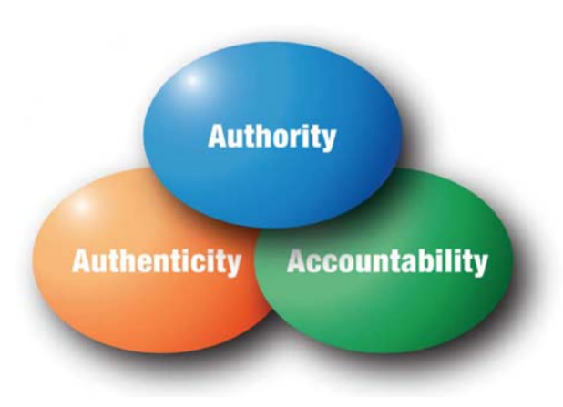
The 3 A's of Public Life

At its essence, civic engagement is important so that public agency leaders and staff can lead and serve their communities with genuine authority, authenticity and accountability.