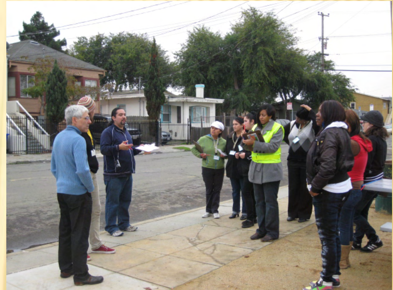
City, County, Parents, Students, BBK, Pogo Park