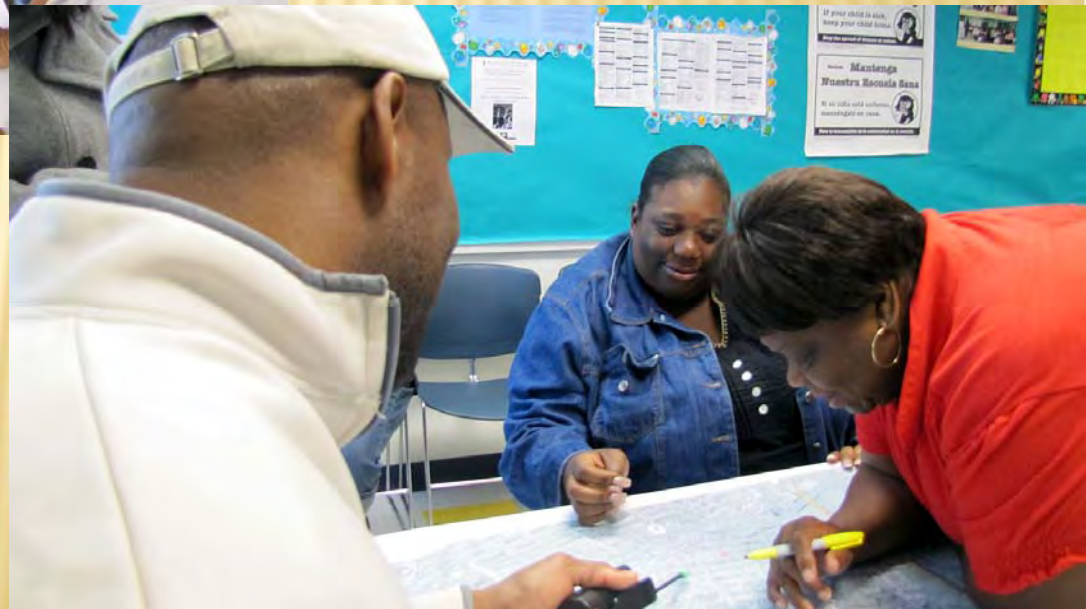
Parent Coffee Hour