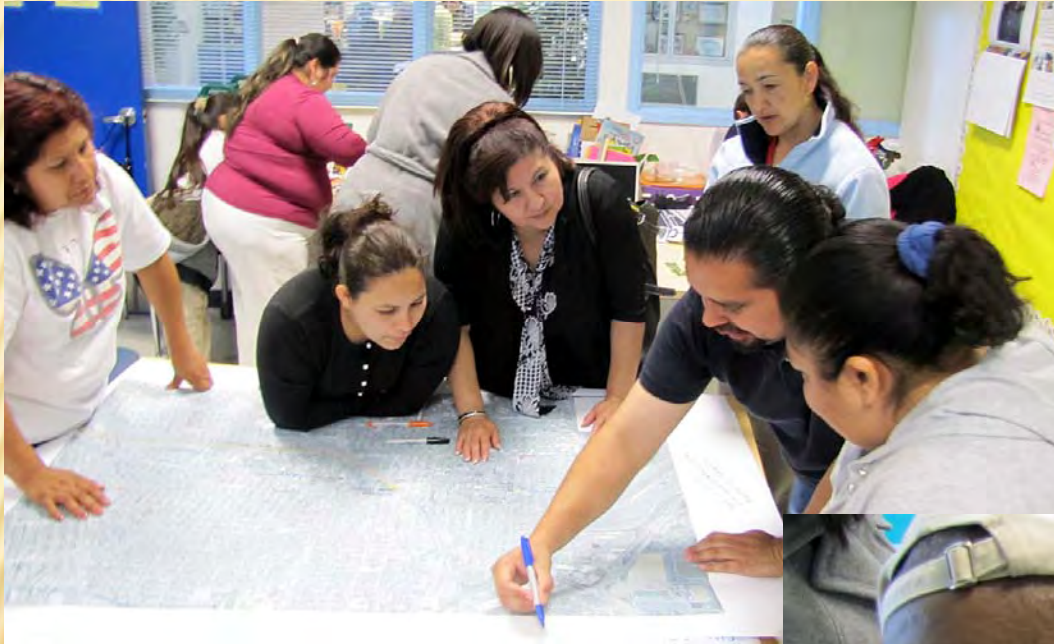
Peres Elementary School