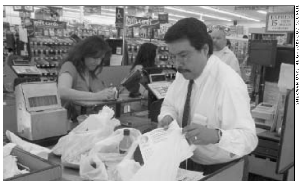
A grocery store manager helps distribute emergency preparedness information to shoppers.

Since Hurricane Katrina, considerable attention has been paid to improving the federal government's ability to respond to large-scale emergencies and to serve vulnerable populations. But in most public emergencies, local governments play the most important role in addressing the