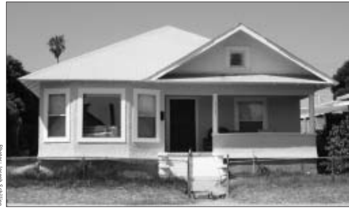
Through persistent application of enforcement procedures, San Diego's vacant properties coordinator succeeded in persuading recalcitrant property owners to bring their properties up to code.