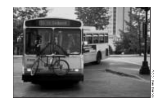
Bike racks on buses extend travel options for cyclists.

Community bike programs are also growing. Tampa, Florida; Portland, Oregon; Madison, Wisconsin; Missoula, Montana; and Boulder, Colorado, offer bikes free and for charge in downtown districts. The most well-known shared bicycle programs are highly visible, with bikes painted a bright color, such as orange in Tampa or yellow in Decatur, Georgia. Montgomery County, Maryland, runs a borrow-a-bike program for employees who work for Rock Springs Park-area businesses.