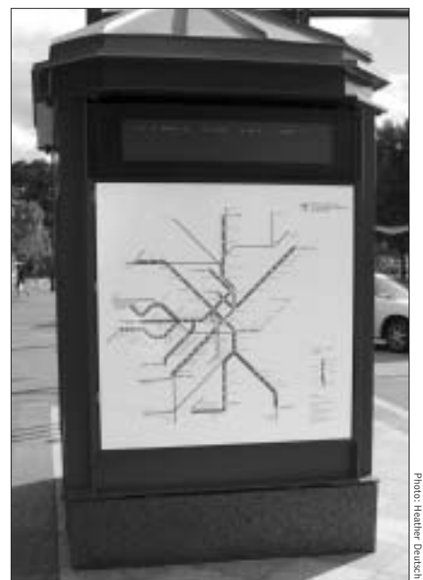
Map of Boston, Massachusetts' subway system.

municating new routes in the event of unexpected route changes or in case of emergencies.