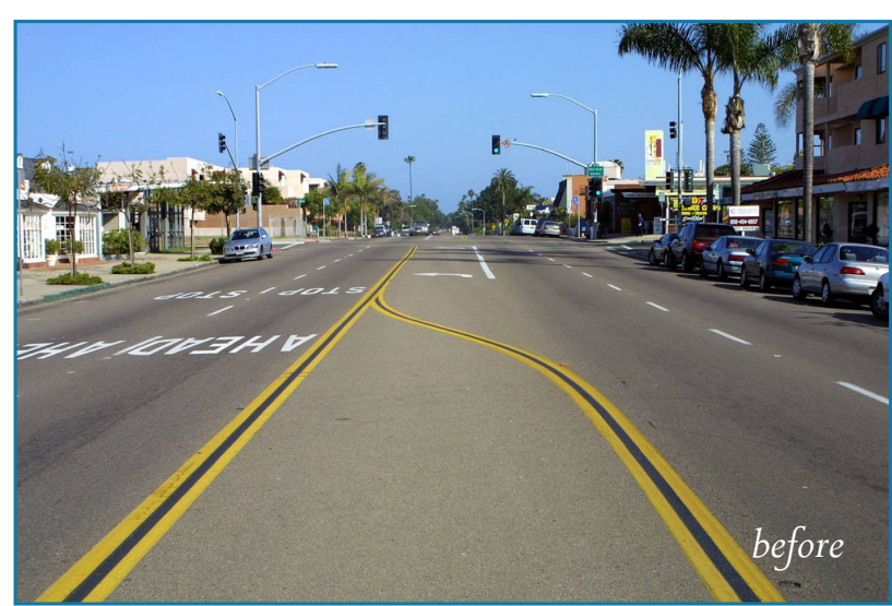
La Jolla Boulevard, San Diego