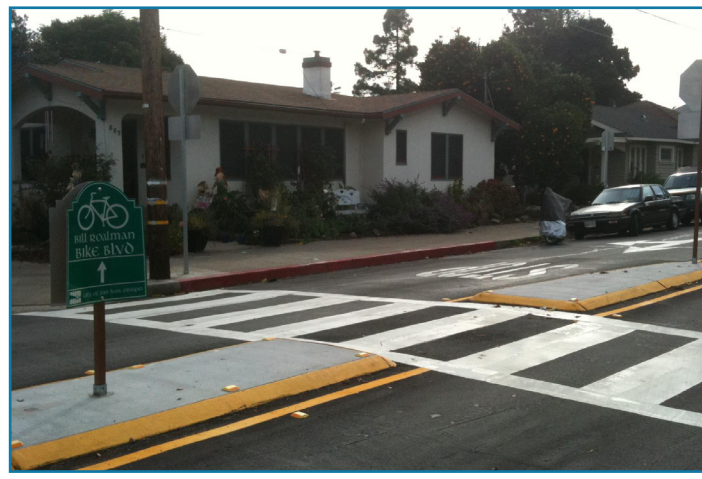
Pedestrian crossing, San Louis Obispo

Complete Streets are also mentioned more generally in SB 375, the California law under which Metropolitan Planning Organizations are establishing per capita greenhouse gas reduction goals, which Complete Streets policies can help achieve.