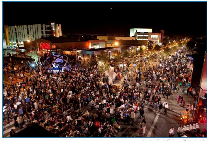
"The BLVD" in Lancaster

In Santa Monica , a reconfiguration of Ocean Boulevard in 2008 to include parallel parking, a center left turn lane, and bicycle lanes resulted in dramatically improved safety. According to the City of Santa Monica, the total number of crashes dropped 65 percent, from 35 to 12, in the first nine months after the changes occurred. Crashes that resulted in injury plummeted by 60 percent during that same nine-month timeframe. To put it another way, crashes along the roadway dropped from an average of four a month to just over one per month.