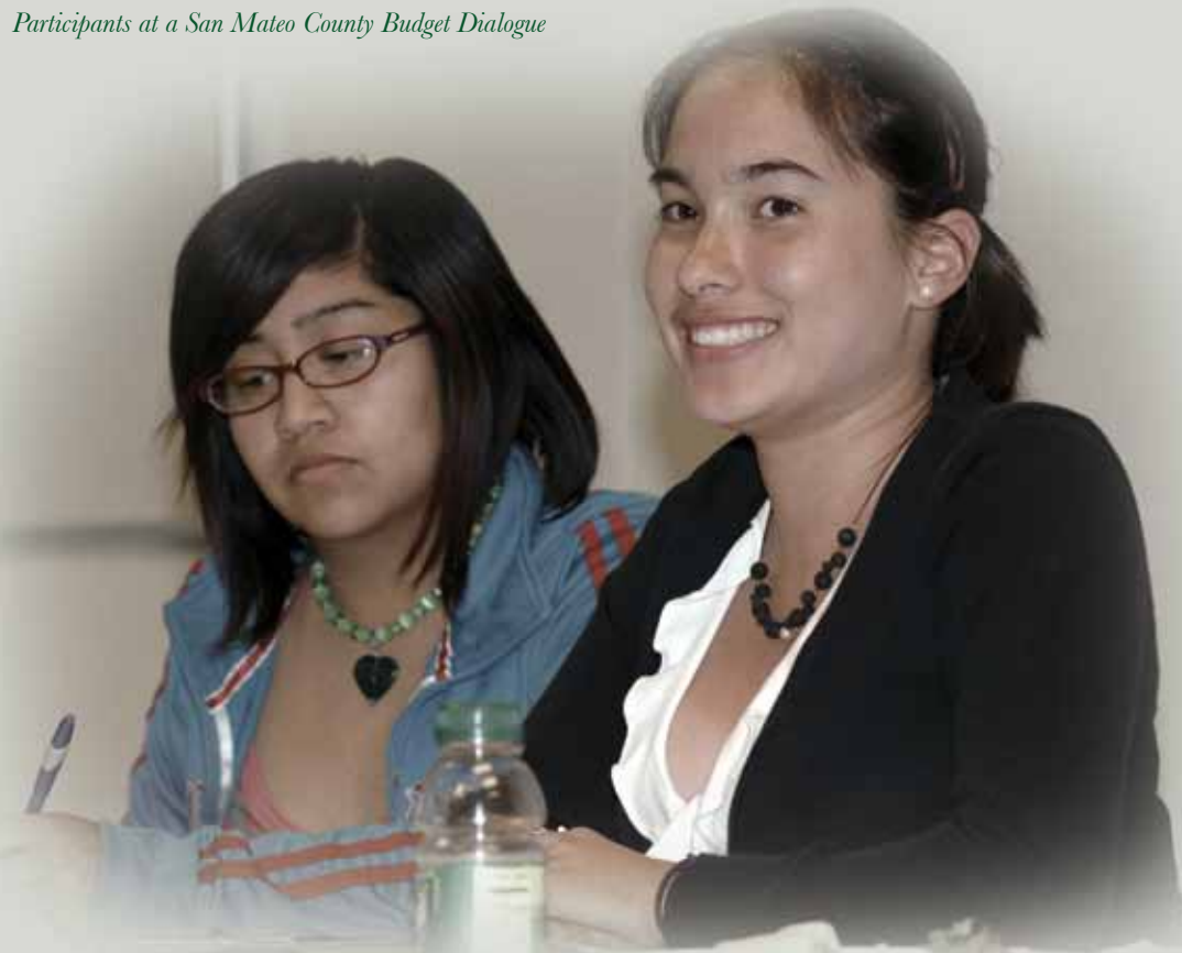
Participants at a San Mateo County Budget Dialogue

Survey methodology affects the validity and usefulness of the results. For example, online surveys only reach a certain segment of the community (those that own and use computers and have access to Internet service).