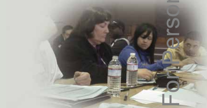
Salinas Residents Discuss Budget Priorities

The phone survey included trade-off questions such as "Would you cut X to increase public safety?" Questions also explored residents' rating of the quality of public services, perception of the agency's budget, priorities for increases or cuts in spending, and attitudes toward budget-related policy issues. A number of demographic questions allowed analysis of survey results by particular subgroups.