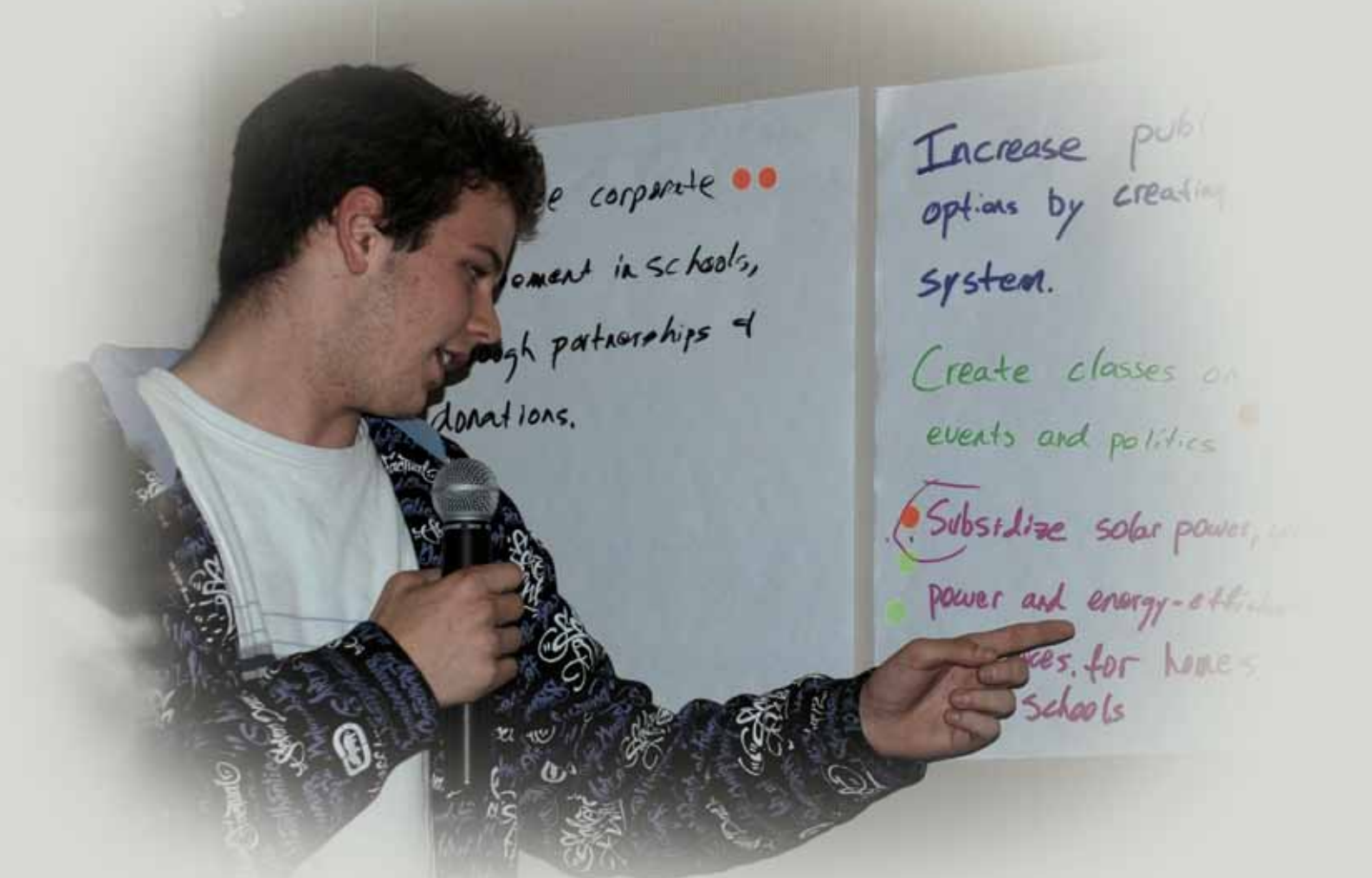
Participants at a San Mateo County Youth Visioning Forum