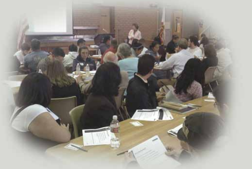
Salina Community Dialogue Budget Forum

A good strategy is to identify the key questions decision-makers and the community face as it relates to the budget. For example: