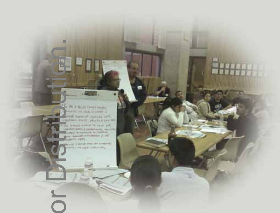
A Budget Forum at Hartnell Community College in Salinas

In the second phase of the public engagement process, community members were invited to deliberate on budget balancing options in three public forums. Nearly 200 community members worked together in small