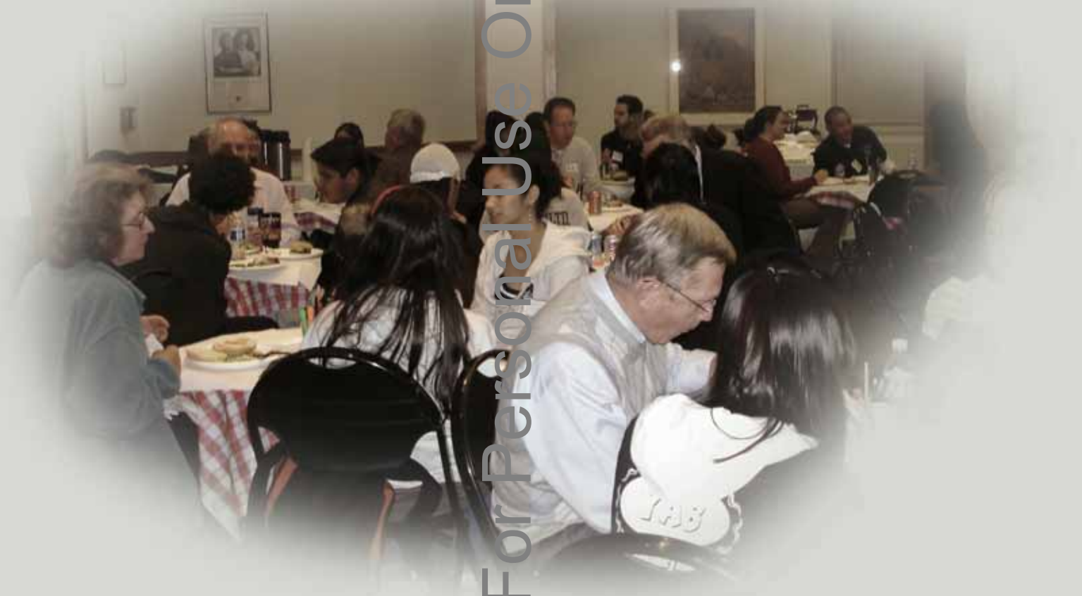
Residents discuss the budget and enjoy a meal at a Redwood City Workshop, OR Redwood City Budget Workshop

The former city budget director feels the dialogues yielded useful information for agency officials, but cautions that high-quality deliberative civic engagement is expensive and takes more time to do effectively. 18 The use of public engagement has to be integrated early enough into the budgeting process to be useful to policy makers and worthwhile to the public.