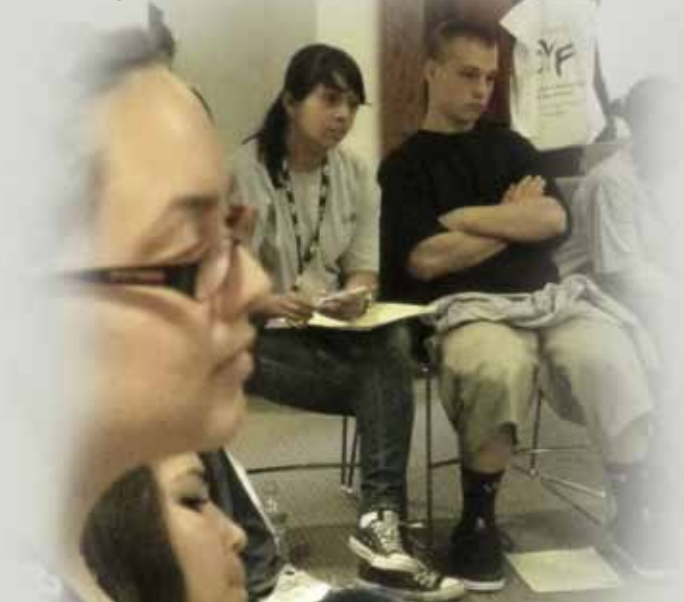
Los Angeles Youth Dialogue