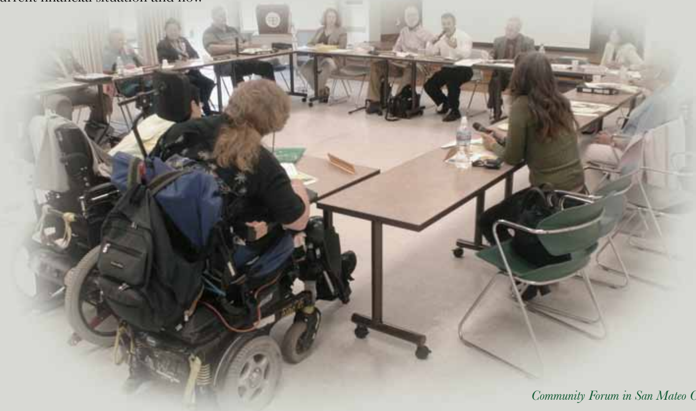
Community Forum in San Mateo County

Committee members are typically recruited, formally or informally, through political and social networks. Elected officials typically appoint or invite committee members. When the committee is composed of representatives of groups and organizations, the committee members can serve as conduits for information between the group and the local agency.