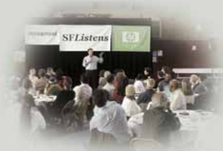
San Francisco residents participate in a high-tech budget forum

The city follows up with residents who participated in the workshops in order to highlight how public input impacted final budget decisions. City officials believe that such follow-up encourages attendance at future public engagement events. An easy to read "Budget-in-Brief" reflecting the results of this public process is mailed to all community members and posted on the city's website.