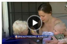
Pot using mom faces charges of child abuse May 31, 2012