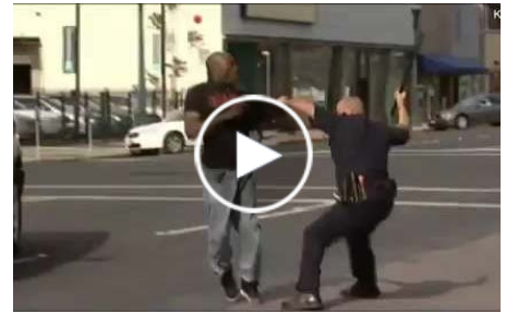
Caught on Tape: Police make forceful arrest May. 02, 2012