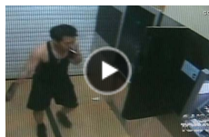
Caught on Camera: Drunk man attacks ATM Jul 11, 2012