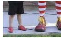
RMHC Fun Run