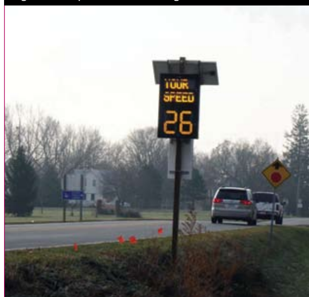
Figure 10. Speed feedback sign in Slater.

Pavement marking legends indicating "SLOW" (as shown in figure 11) were used at two locations along the western section of SH 210 in Slater. The first pavement legend was placed just inside the