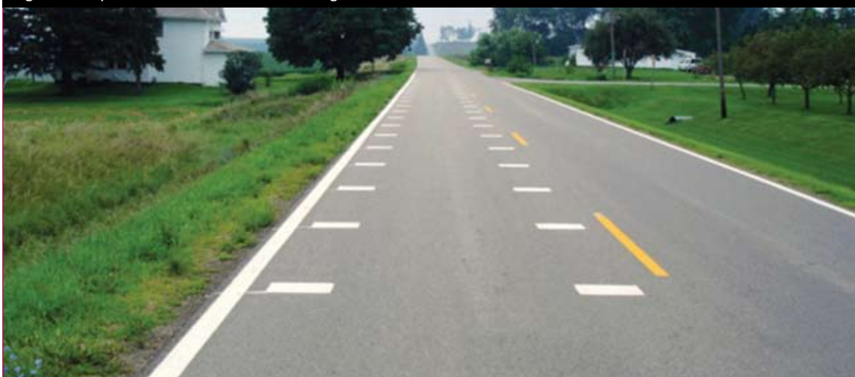
Figure 1. Experimental transverse markings at entrance to Union.

Speed feedback signs (figure 2) were also installed within Union. These signs consisted of a static "Your Speed" sign and an electronic display of the approaching vehicle speed measured by radar. These signs were installed for inbound motorists at the north and west city entrances and were placed immediately downstream of the transverse markings as shown in figure 3. Due to purchasing and installation problems,