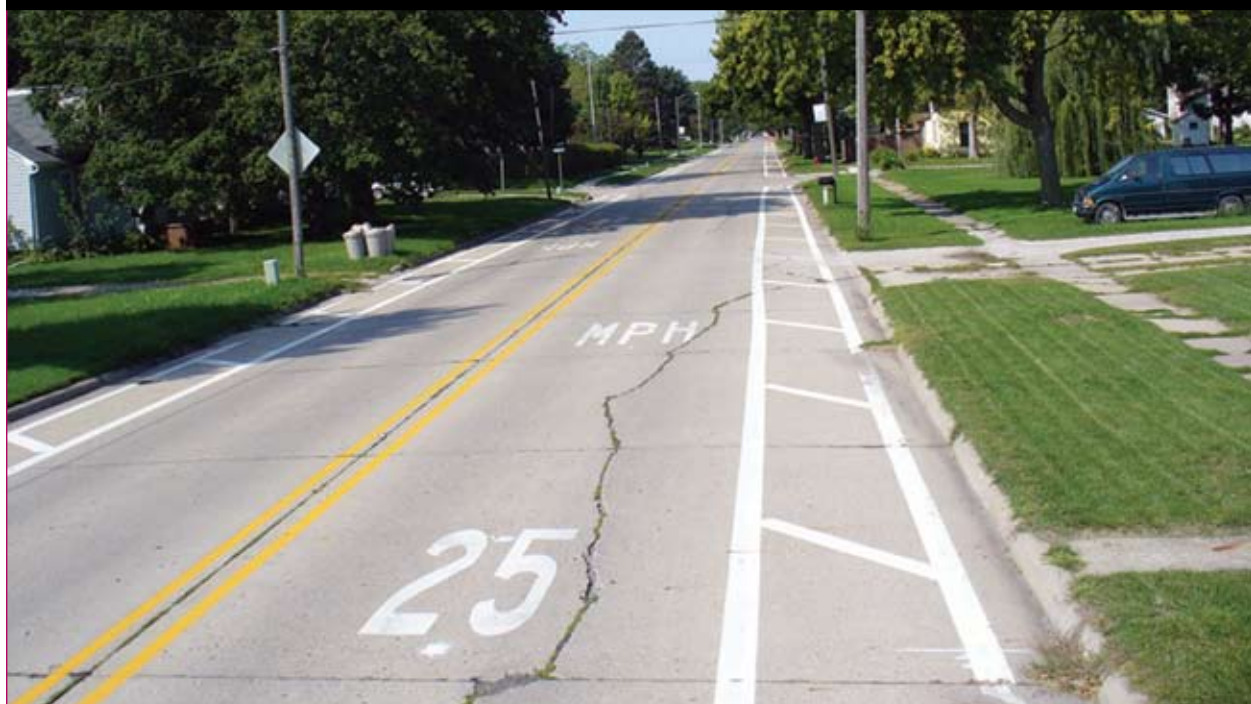
Figure 6. Shoulder markings used to narrow travel lanes in Roland.

Data were collected at the midpoint of the narrowed section. As shown in table 5, the lane narrowing and speed limit markings were not effective in reducing vehicle speeds. There were no consistent changes in the 85th