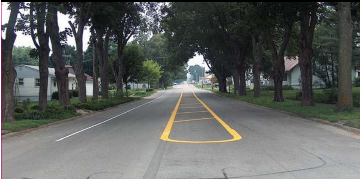
Figure 4. Painted center island and edgeline used to narrow lane.

Table 3 summarizes speed data collected midway through the narrowed section (U3), as shown in figure 3. Results are presented for both