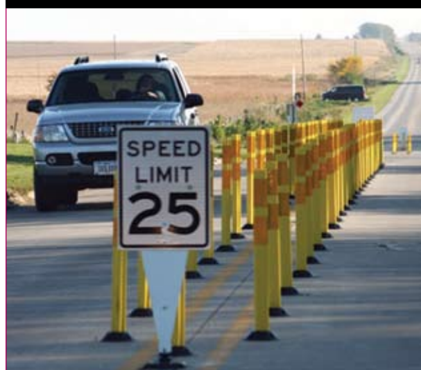
Figure 9. Tubular channelizing markers used for center island to narrow lanes.

A speed feedback sign pictured in figure 10 was