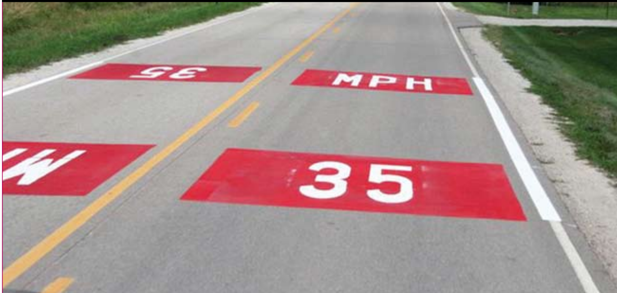
Figure 12. Speed limit markings with experimental red background in Dexter.