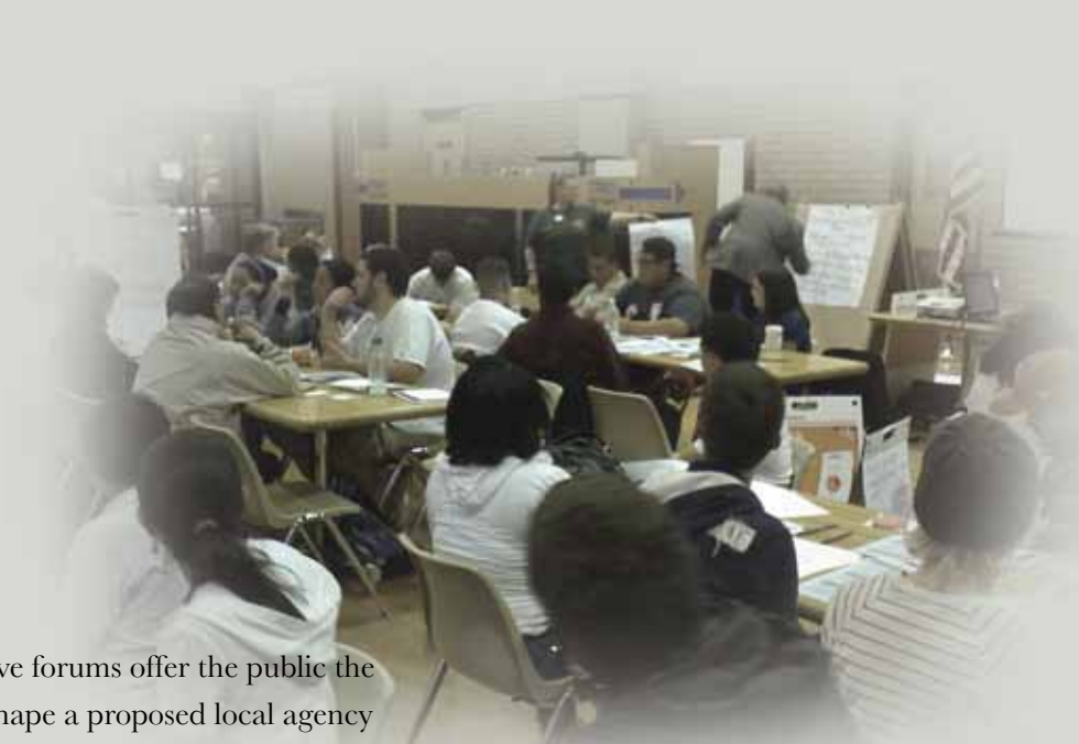
A Budget Forum at Hartnell Community College in Salinas

For more information, visit www.ca-ilg.org/cgi .