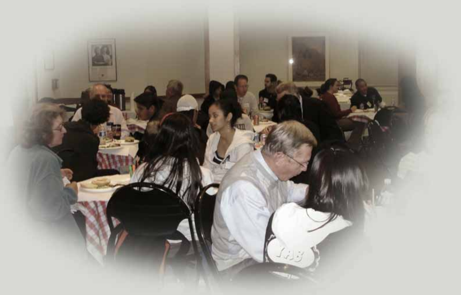
Residents discuss the budget and enjoy a meal at a Redwood City Workshop, OR Redwood City Budget Workshop

The former city budget director feels the dialogues yielded useful information for agency officials, but cautions that high-quality deliberative civic engagement is expensive and takes more time to do effectively. 18 The use of public engagement has to be integrated early enough into the budgeting process to be useful to policy makers and worthwhile to the public.