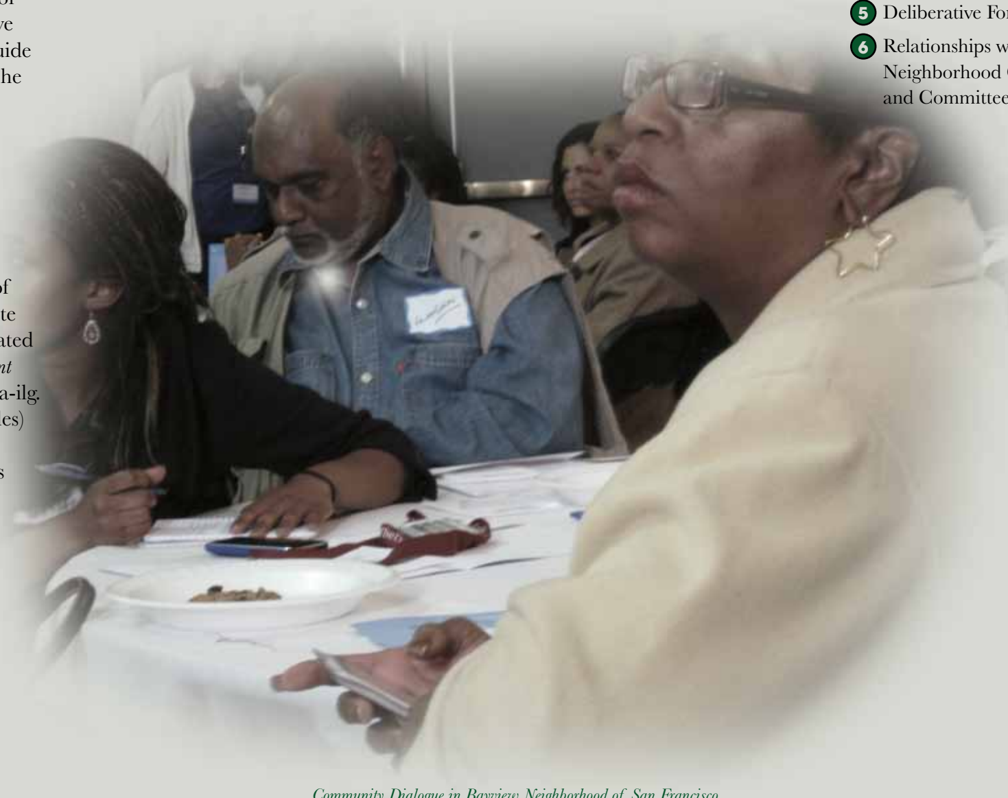
Community Dialogue in Bayview Neighborhood of San Francisco

It's also important for the community to understand when choices have been made by other decision-makers. For example, state and federal law dictates some local expenditures. Decisions made by state and federal officials also can affect the availability of revenues to meet community priorities, as can economic forces.