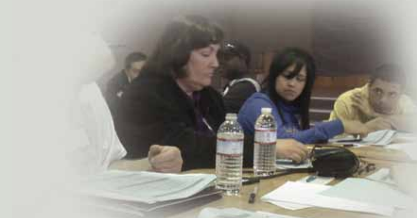
Salinas Residents Discuss Budget Priorities

The phone survey included trade-off questions such as "Would you cut X to increase public safety?" Questions also explored residents' rating of the quality of public services, perception of the agency's budget, priorities for increases or cuts in spending, and attitudes toward budget-related policy issues. A number of demographic questions allowed analysis of survey results by particular subgroups.