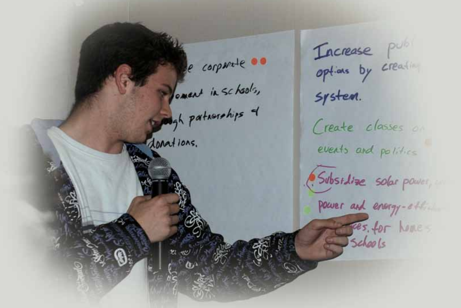
Participants at a San Mateo County Youth Visioning Forum

The committee presented its report to the city council in April 2009 and recommended that a measure to approve a half-cent sales tax increase subject to a four year sunset provision should be placed on the ballot. The mayor of Ventura commented that, “this intense, three-month budgeting exercise that