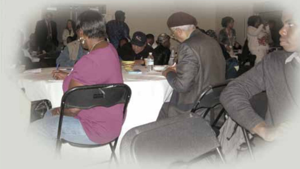
Community Dialogue in Bayview neighborhood of San Francisco