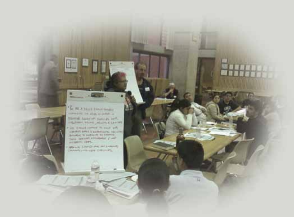
A Budget Forum at Hartnell Community College in Salinas

In the second phase of the public engagement process, community members were invited to deliberate on budget balancing options in three public forums. Nearly 200 community members worked together in small