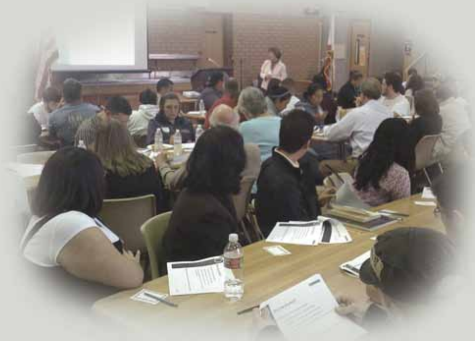
Salina Community Dialogue Budget Forum

A good strategy is to identify the key questions decision-makers and the community face as it relates to the budget. For example: