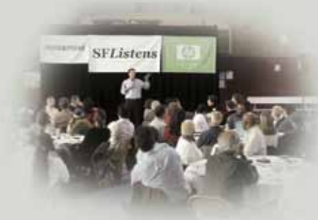
San Francisco residents participate in a high-tech budget forum

Additional outreach includes specific notices to over 200 community groups and individuals, coverage in the local press and on the city's website, invitations to members of the media to attend workshop briefings on budget issues, and requests for the involvement of the city's approximately one hundred advisory bodies.